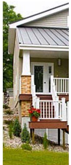
Oak Park full view door glass