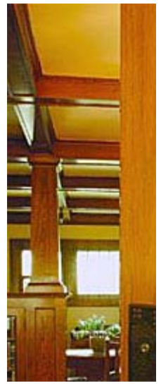
Oak Park glass design Rectangle Craftsman doorlight